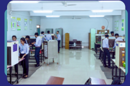
Well Equipped Labs