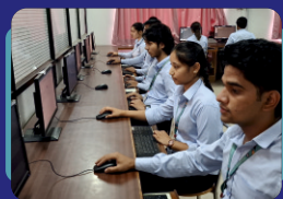
Training in Green Skill & AI