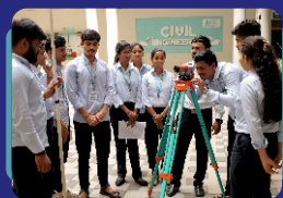
Hands on Sessions