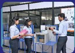
Learning at Incubation Centre