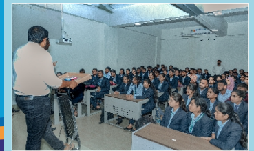
AC Class Rooms