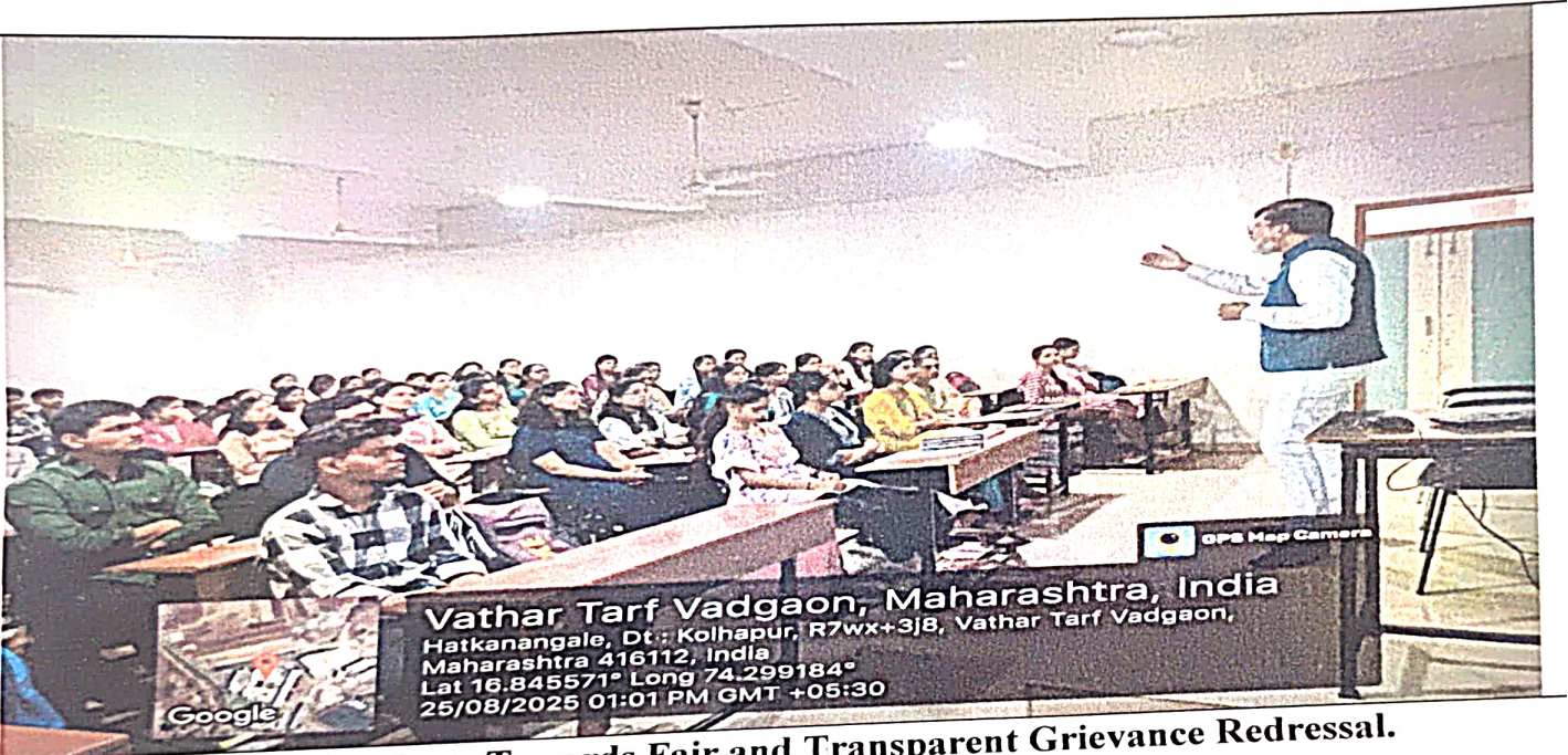
Creating Awareness on Student Grievances and Redressal Mechanism.

Vathar Tarf Vadgaon, Maharashtra, India Hatkanangale, Dt : Kolhapur, R7wx+3j8, Vathar Tarf Vadgaon, Maharashtra 416112, India Lat 16.845571° Long 74.299184° 25/08/2025 01:01 PM GMT +05:30